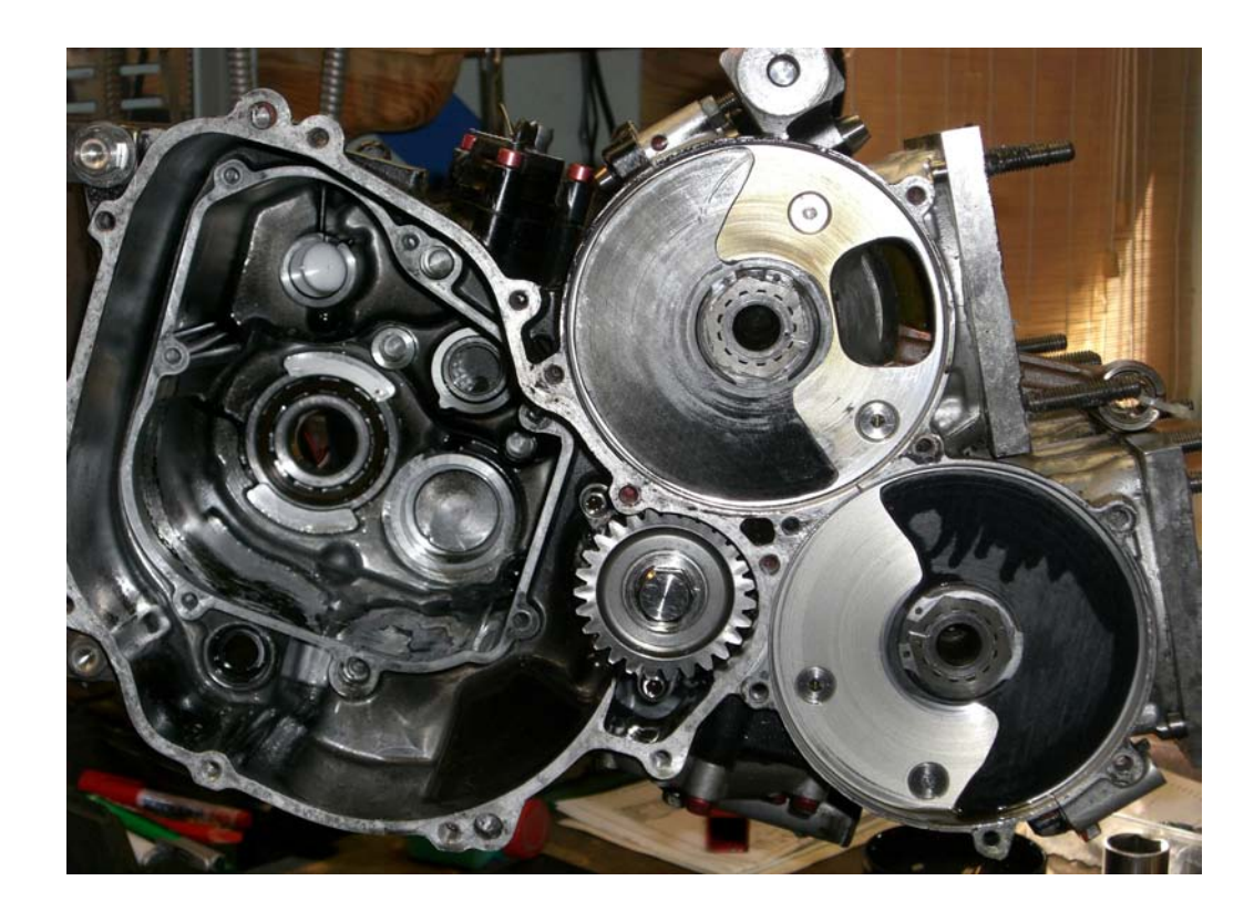
The engine, Here one sees the intermediate plates. To therefore install those

The transmission comes from GHN Racing It is gradated like a running transmission and to the original transmission an more intensified execution over in the running employment the requirement stood zuhalten. If one must drive on the racing course wants.